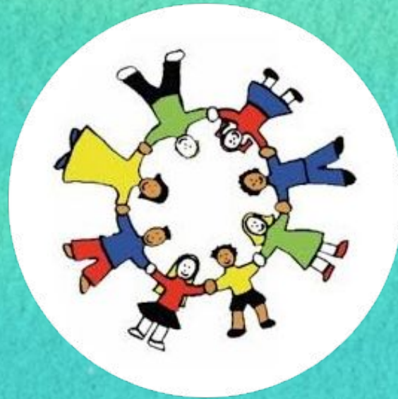
Cavendish Community Primary School, West Didsbury